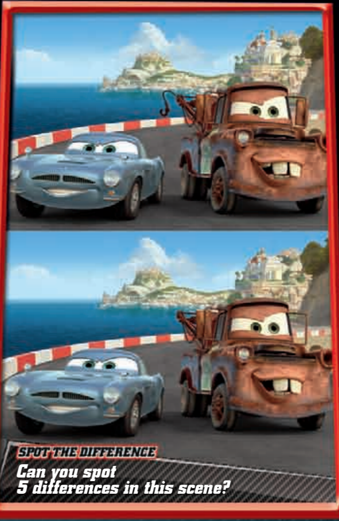
SPOT THE DIFFERENCE Can you spot 5 differences in this scene?