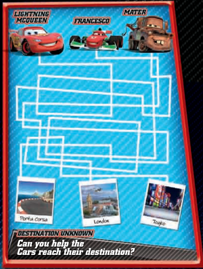
DESTINATION UNKNOWN Can you help the Cars reach their destination?